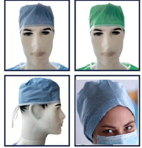
Customizable product. Photo for reference only.

Color : Blue, Green Packaging : Packaging in bags 100 pieces Sizes : Standard Material : 30 gr. of SMS Classification : Category I Product Type : Protective Operation Cap Model Definition : Disposable Operation Cap